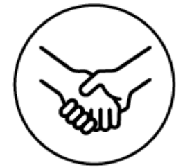
CLIENT & COMMUNITY ENGAGEMENT